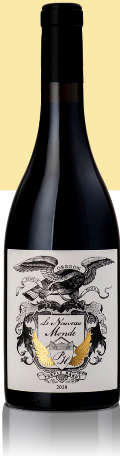
Cody's Homage to 2018, a 5-Barrel Selection from 2 Single Vineyards